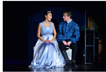
Cinderella and the Prince sing of their love that had formed just "10 minutes Ago."