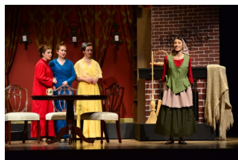
The Cinderella and her step family sing of what "A Lovely Night" they had at the ball.