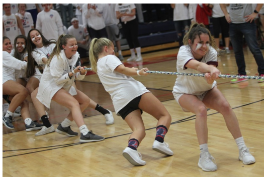
The sophomore girls fight valiantly to beat the junior girls in a game of tug of war.