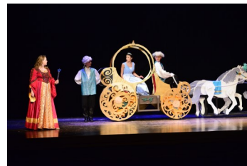
Fairy Godmother sends Cinderella off to the ball in her magical carriage, showing her that "impossible things happen every day."

Overall, the Patriot Players put on a wonderful show, as usual, and the school and the entire community cannot wait until their 2018 spring performance of Joseph and the Amazing Technicolor Dreamcoat.