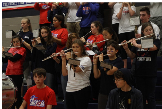
The CB East Band accompanies the senior class into the gym.